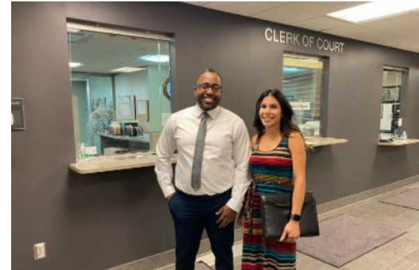
New Deputy Clerk of Court in Watford City (he's from Massachusetts – he inquired about ND jobs using link below)