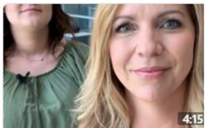
E Services LLC is hiring Winch Truck Drivers and Hot Shot Drivers in Watfor...