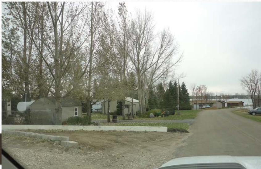
Retaining Wall (left) Trees and Retaining Wall (below)