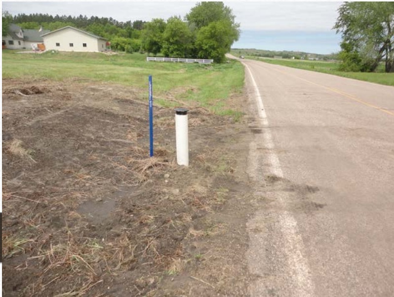
Rural Water (left) Trees and Logs (below)