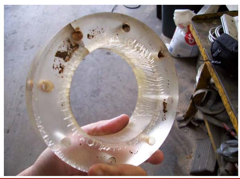
U.S. Department of Transportation